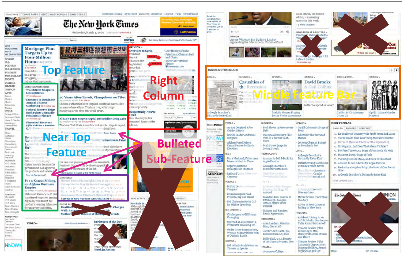
Figure 1 HOME PAGE LOCATION CLASSIFICATIONS

Notes: Portions with “X” through them always featured Associated Press and Reuters news stories, videos, blogs, or advertisements rather than articles by New York Times reporters.